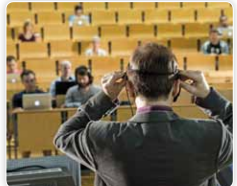
Spoken language translation: Combination of automatic speech recognition and machine translation