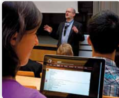
Bridging the language barrier with automatic simultaneous lecture translation systems