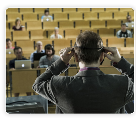
Spoken language translation: Combination of automatic speech recognition and machine translation