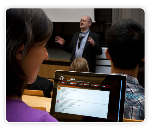
Bridging the language barrier with automatic simultaneous lecture translation systems