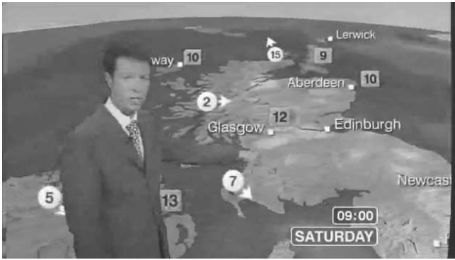
Figure 2: A screenshot of a Weatherview report.