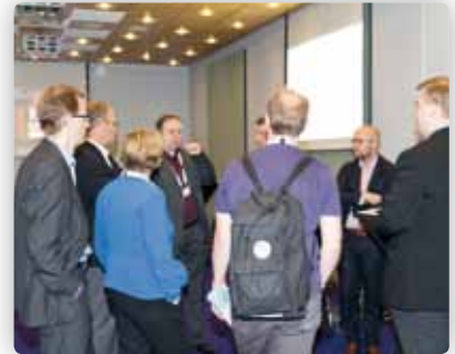
EU-BRIDGE presenting its technologies at IBC 2014

EU-BRIDGE aims to profit from the large audience and amount of experts being present at CeBIT. EU-BRIDGE will be present at the booth of KIT during the whole exhibition and will furthermore organise its Technology Day on the second day of CeBIT in the convention centre.