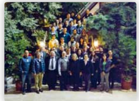
About 70 participants at IWSLT 2014 in the South Lake Tahoe Resort Hotel