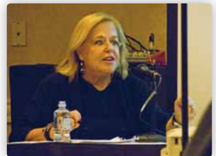
Olga Cosmidou, Director General for Interpretation and Conferences, European Parliament giving a key-note.

Quality assurance in multilingual conference interpreting - the European Parliament experience. The invited talk was followed by a round table on the topic of quality in interpretation.