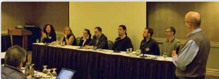
Round table: Quality in interpretation